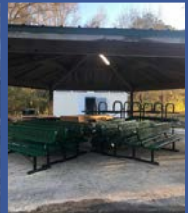
New Benches & Picnic Tables