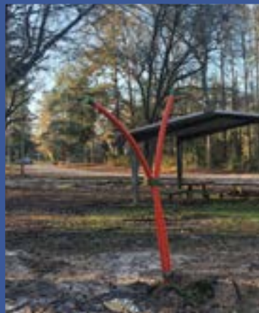
Conduit for New Free Wi-Fi Service