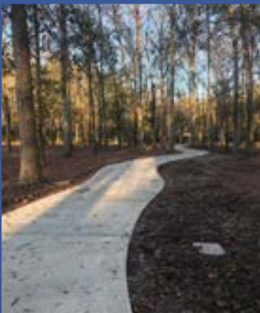
Lighted 1/3 Mile Walking Trail