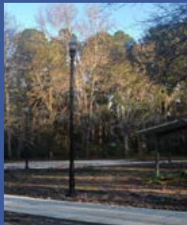
Lighted 1/3 Mile Walking Trail